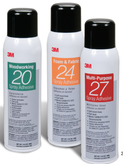
3M™ Woodworking 20 Spray Adhesive 3M™ Foam & Fabric 24 Spray Adhesive 3M™ Multi-Purpose 27 Spray Adhesive