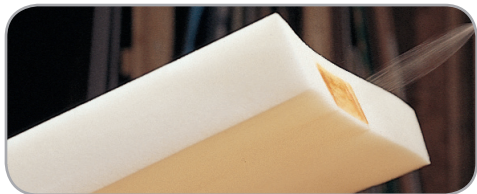
5 3M™ Foam & Fabric 24 Spray Adhesive is ideal for upholstery applications.