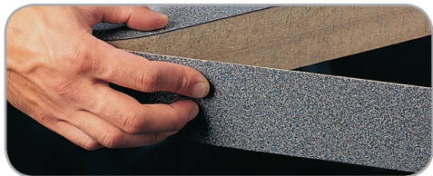
3 3M™ Woodworking 20 Spray Adhesive is a high strength adhesive ideal for bonding laminates, veneers and many other woodworking projects.