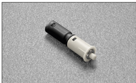
DPMSNB - beige