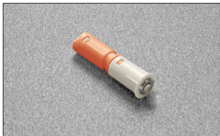
DPASNB - beige