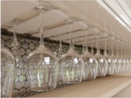
What's In the Box