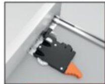
AFCGXX3B Standard mount - 6-way adjustable