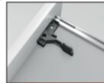
AFCEX56B Standard mount - 2-way clip, with side fixing

For any further information and requests: