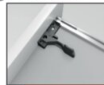
AFCEX56B Standard mount - 2-way clip, with side fixing

For any further information and requests: