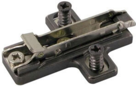
Plate Winged 4mm Titanium Euroscrew