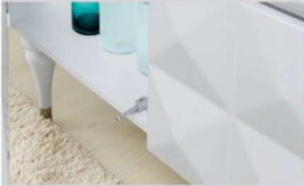
Magnetic Push Latches for Free-Swinging (Unsprung) Hinges